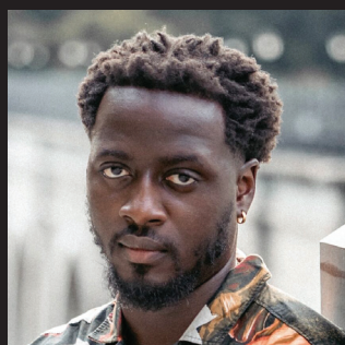
Nana Kwame Adjei-Brenyah